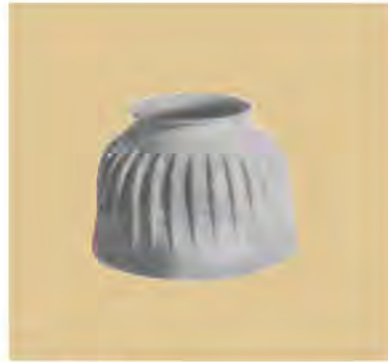
NO.1207 RUBBER PULL ON BOOTS Size: XL, L, M Color:black(4),white(5) 50 prs/Box