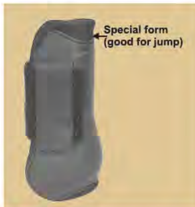
NO.1143 DELUXE SPLINT BOOTS Provides a more comfortable perfect fit and high protection molded plastic (PU) outer shell for support, soft neoprene lining, double velcro closure. Frontlegs Size:L(FULL) & S(PONY) Color:blue(2),black(4),white(5),brown(6), 50 prs/Box