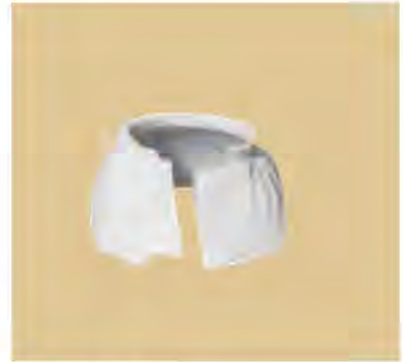
NO.1204A BELL BOOTS WITH DOUBLE VELCRO Size: XL, L, M, S Color:black(4),white(5) 50 prs/Box