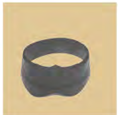
NO.1248 GRAB BOOTS Protects coronet and heel, rubber. Maximum protection for horses that overstep and pull their shoes off. Easy pull-on application. Size:L, M, S Color:black(4), white(5) 50 prs/Box