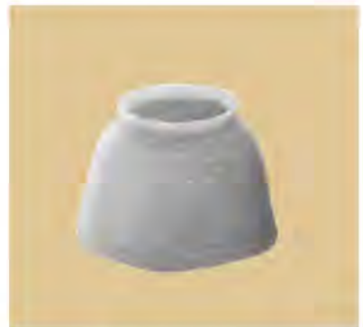
NO.1206 SMOOTH RUBBER BELL BOOTS Size: L, M, S Color:gum(natural rubber) 50 prs/Box