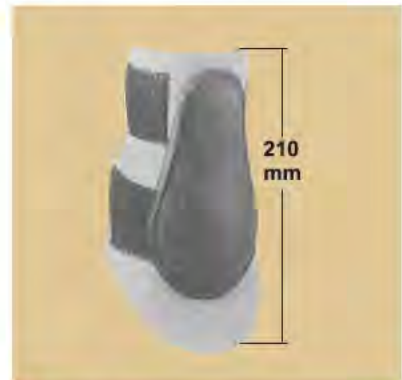
NO.1003 PONY SPLINT BOOTS Soft rubber lining mold to shape of horse's leg outer shell made of neoprene double velcro closure. Color:black(4) 50 prs/Box