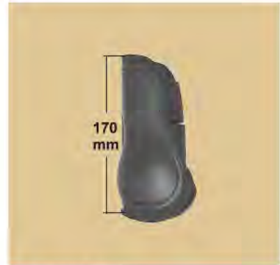
NO.1123-P PONY DELUXE SPLINT BOOTS Features the special reinforcement patch over the splint and bones and double velcro closure Color:black(4), Size:pony 50 prs/Box