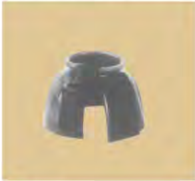
NO.1202 VELCRO RUBBER BELL BOOTS Size: XL, L, M, S Color:black(4),white(5) 50 prs/Box