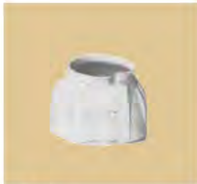
NO.1231 VELCRO RUBBER BELL BOOTS Size: XL, L, M, S Color:black(4),white(5) 50 prs/Box