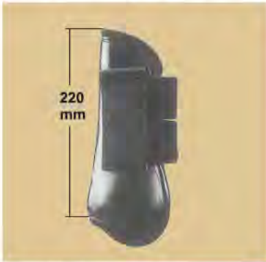
NO.1120 DELUXE SPLINT BOOTS Features the special reinforcement patch over the splint and bones and double velcro closure. Color:black(4),hind 50 prs/Box