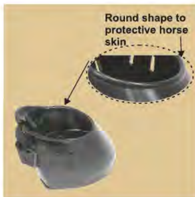
NO.1247 BARRIER BOOT An emergency shoe replacement which covers hoof wall and entire bottom to protect against splits and nicks when unshoe. Color:black(4) Size:2(12cm), 3(13cm) 50/Box