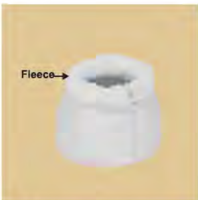
NO.1242 FLEECE-TOP BELL BOOTS Pliable rubber boot with comfortable fleece edging to prevent rubbing. Double velcro closure for easy application. Size:XL, L, M, S Color:black(4), white(5) 50 prs/Box