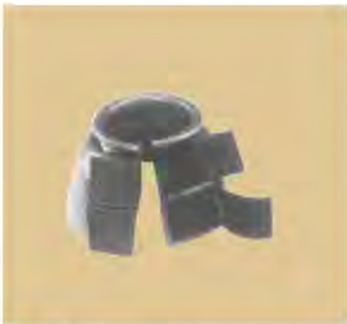
NO.1205 SMOOTH BELL BOOTS WITH DOUBLE VELCRO Size: L, M, S Color:black(4),white(5) 50 prs/Box