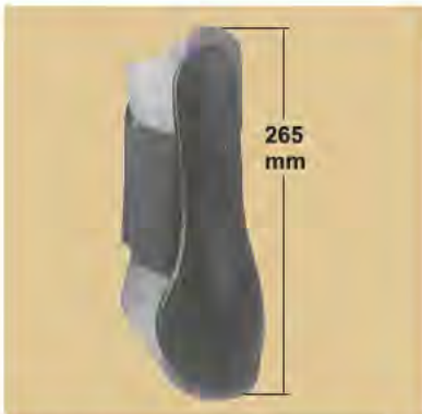
NO.1118 GALLOPING BOOTS Soft rubber lining mold to shape of horse's leg outer shell made of neoprene double velcro closure. Size: L, M Color:black(4), hind 50 prs/Box