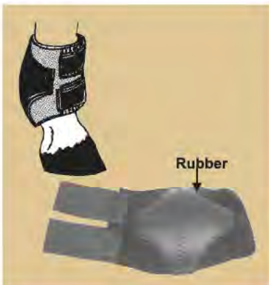
NO.1103 RUNDOWN AND ANKLE BOOTS Shaped to fit the ankle area protects sesamoid from bruises and abrasions. Reinforced with rubber cap at heel. Color:black(4) 50 prs/Box