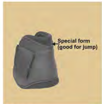
NO.1141 DELUXE ANKLE BOOTS Provides a more comfortable perfect fit and high protection molded plastic (PU) outer shell for support, soft neoprene lining, double velcro closure. Hindlegs Size:L(FULL) & S(PONY) Color:blue(2),black(4),white(5),brown(6), 50 prs/Box