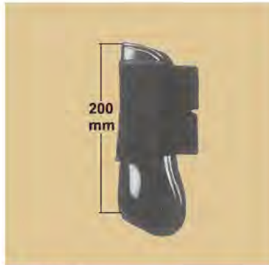
NO.1123 DELUXE SPLINT BOOTS Features the special reinforcement patch over the splint and bones and double velcro closure Color:black(4), front 50 prs/Box