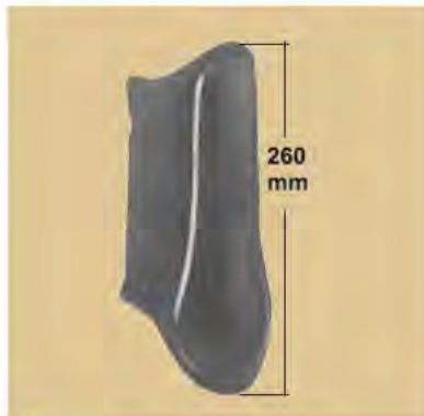
NO.1119 GALLOPING BOOTS Soft rubber lining mold to shape of horse's leg outer shell made of neoprene double velcro closure Size: L, M, S Color:black(4), front 50 prs/Box